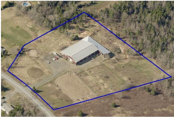
Front Land PID# 45339355 5 acres