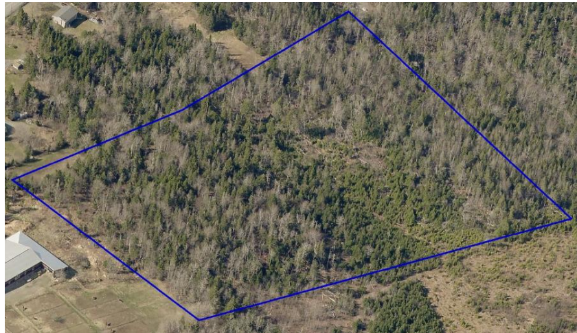
Rear Lands PID# 45142700 11 acres